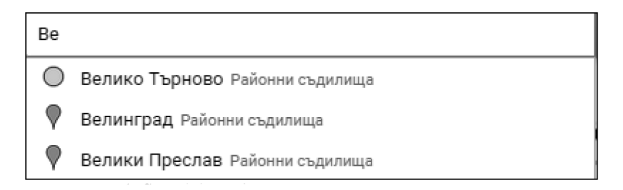
Fig.1. Search by string

Based on the results of the study a national map of the studied regional courts is prepared [10], consistent with the level of maturity. The map is made with the tools of Google My Maps, the icons for each of the 4 levels of maturity (there are no Regional courts in the 5-th level) are in a different color, allowing you to see more clearly their place.